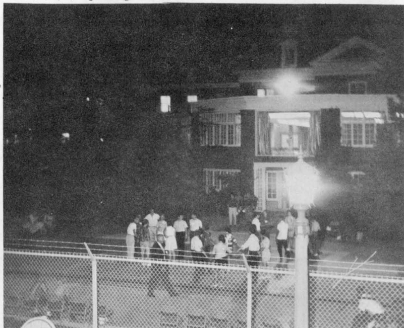
LIGHTS BLAZE AGAINST the night sky as students' square dance beneath the stars at the pool and patio mixer, August 26.