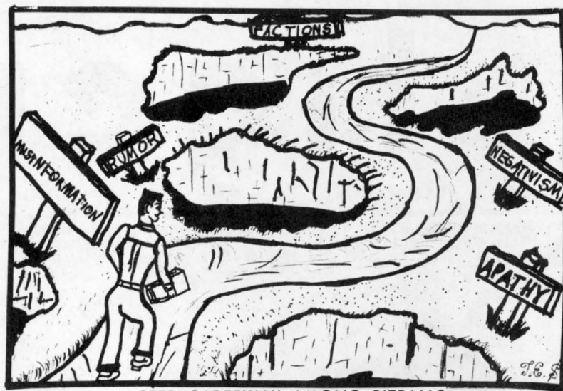
STEP CAREFULLY AMONG PITFALLS

Take care, for each is adept at the usual cloak-and-dagger techniques. They listen from behind lounge polls, leave propaganda on blackboards and contaminate even zoo dissection kits, they deviously the best pinochle deck. Hidden under lunch tables, within clouds of smoke (pipe and cigarette), and in zoo dissection kits, they deviously gather material for their subversive plot.